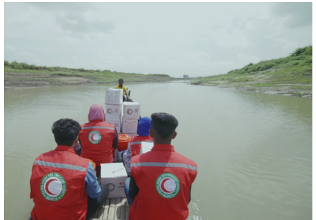
Bangladesh Red Crescent volunteers carrying relief items to communities in Companiganj, Sylhet during flood operation 2022.

provided immediate relief but set the stage for a sustained and resilient recovery.