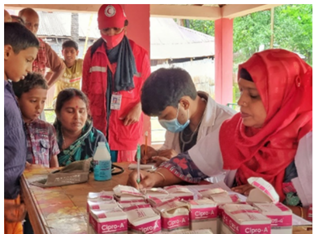
BDRCS medical team is giving medical support to flood affected people in Sylhet.

Shelter provision was a central focus of BDRCS's response. Tarpaulins were swiftly distributed to 16,000 individuals, emergency shelter toolkits provided to 1,500 households, and conditional cash grants facilitated repairs for 500 households. These actions, aligning with Sphere's standards for safe and dignified housing, addressed immediate needs while laying the groundwork for long-term recovery.